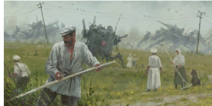
Detail from "First Harvest after the War" by Jakub Rozalski, 2019